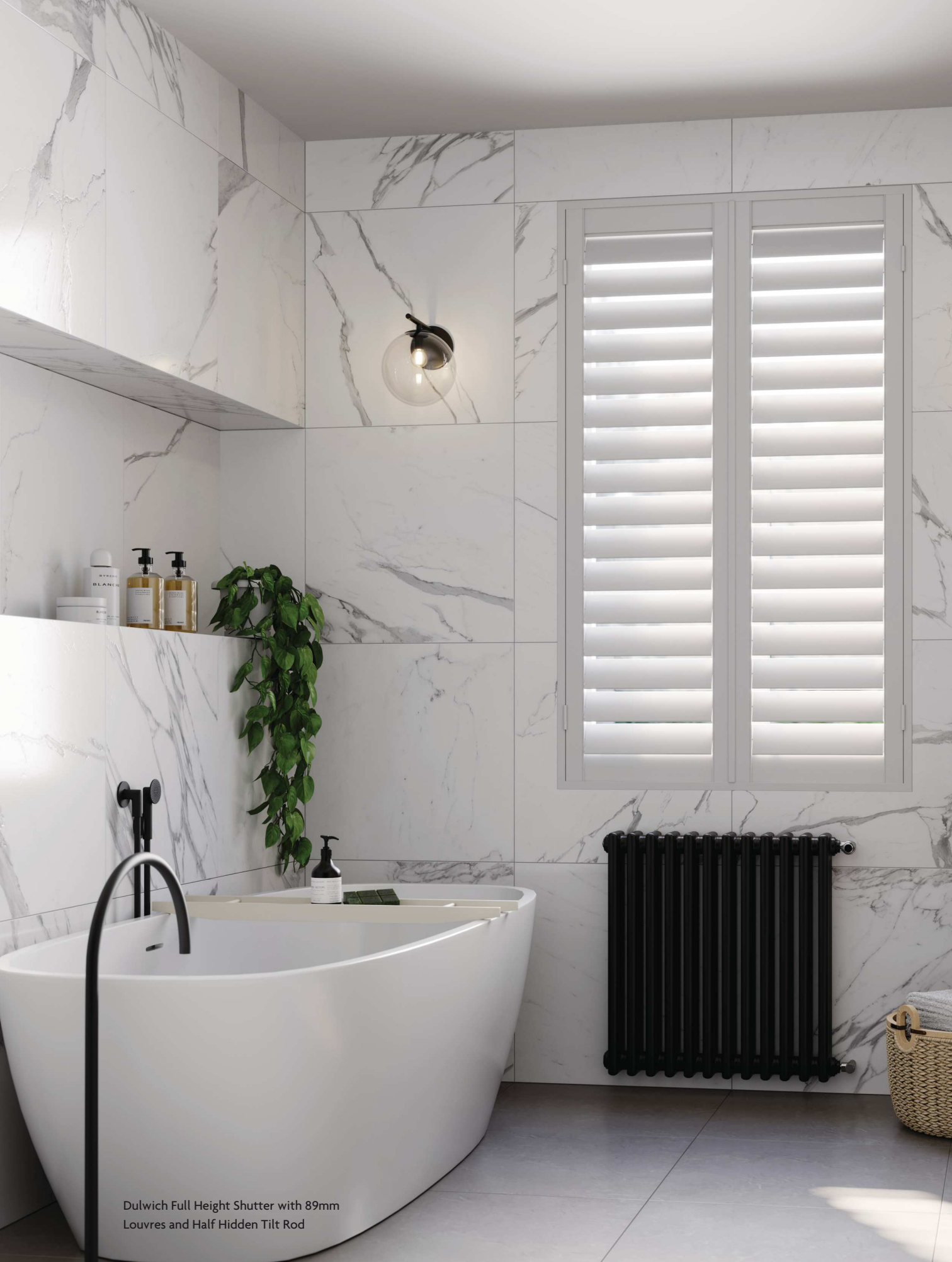
Dulwich Full Height Shutter with 89mm Louvres and Half Hidden Tilt Rod