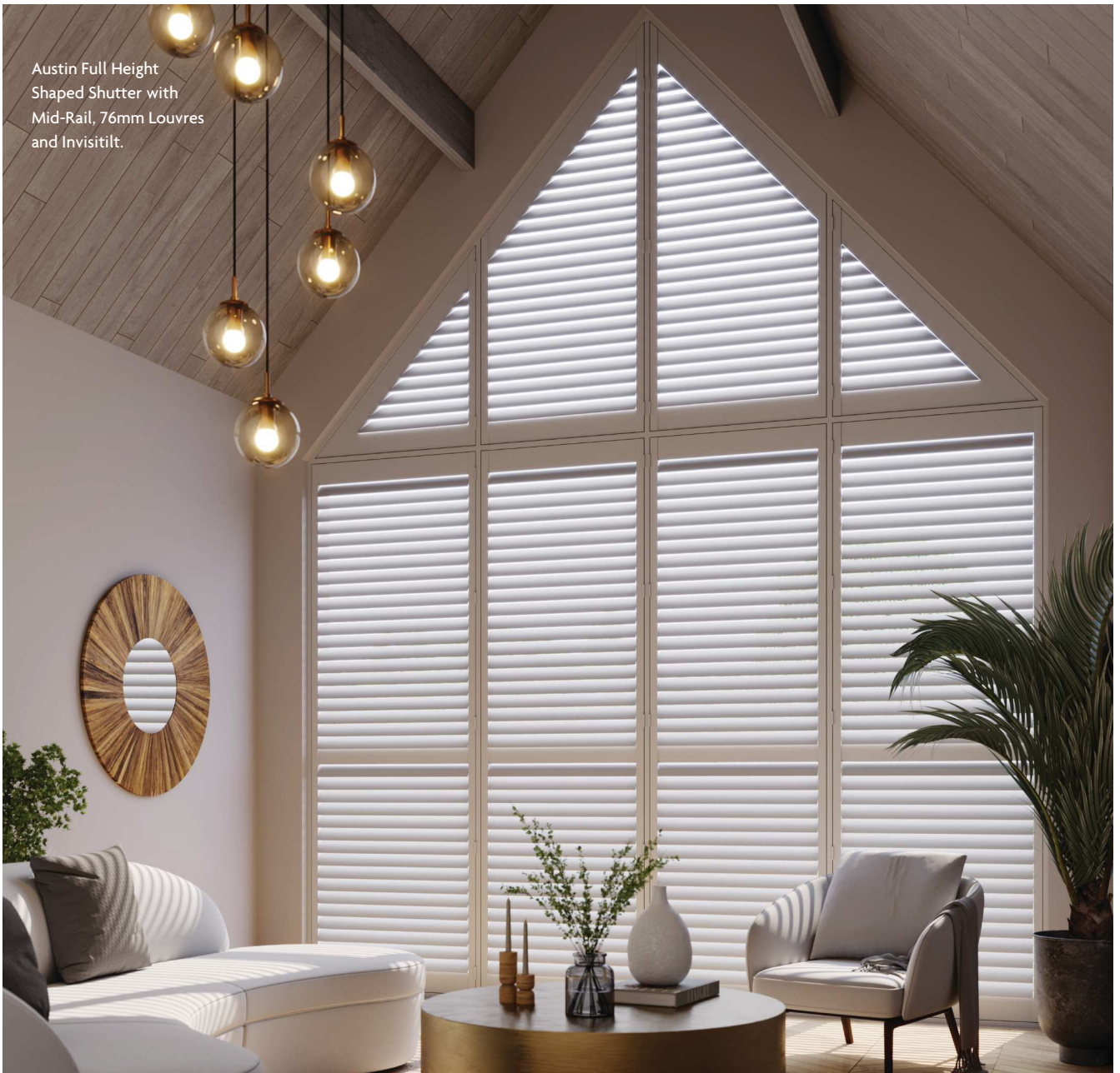
Austin Full Height Shaped Shutter with Mid-Rail, 76mm Louvres and Invisitilt.

Whether large or small, traditional or modern, square bay or curved bay, rectangular, square or shaped, all windows are catered for within our comprehensive portfolio of shutter products. Any shape is available in our Austin and Newport hardwood shutter range.