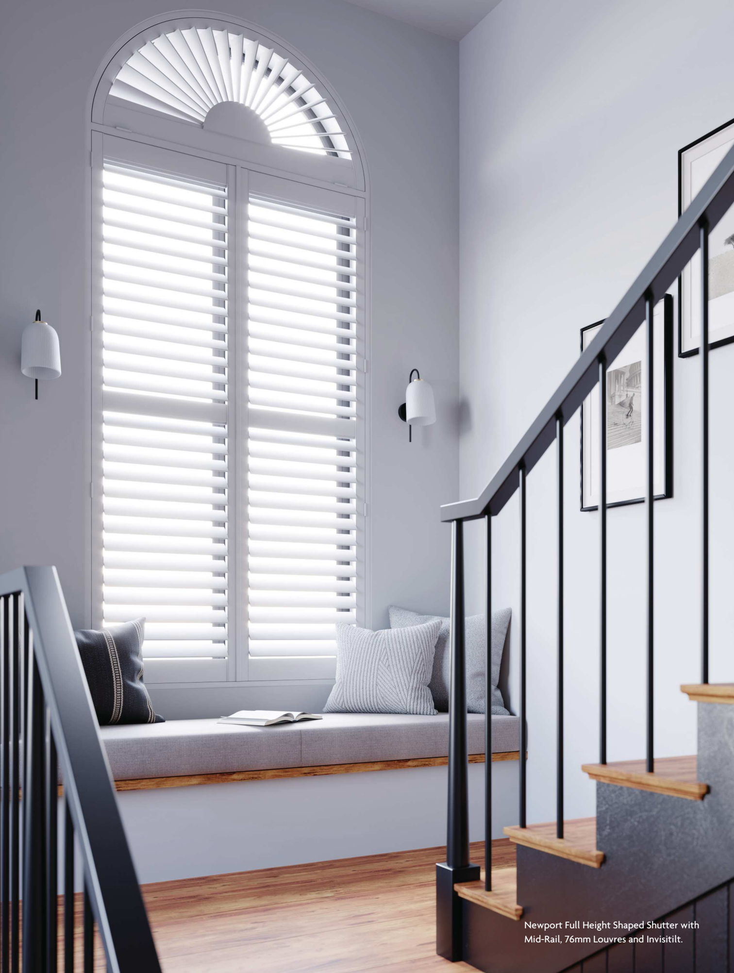
Newport Full Height Shaped Shutter with Mid-Rail, 76mm Louvres and Invisitilt.