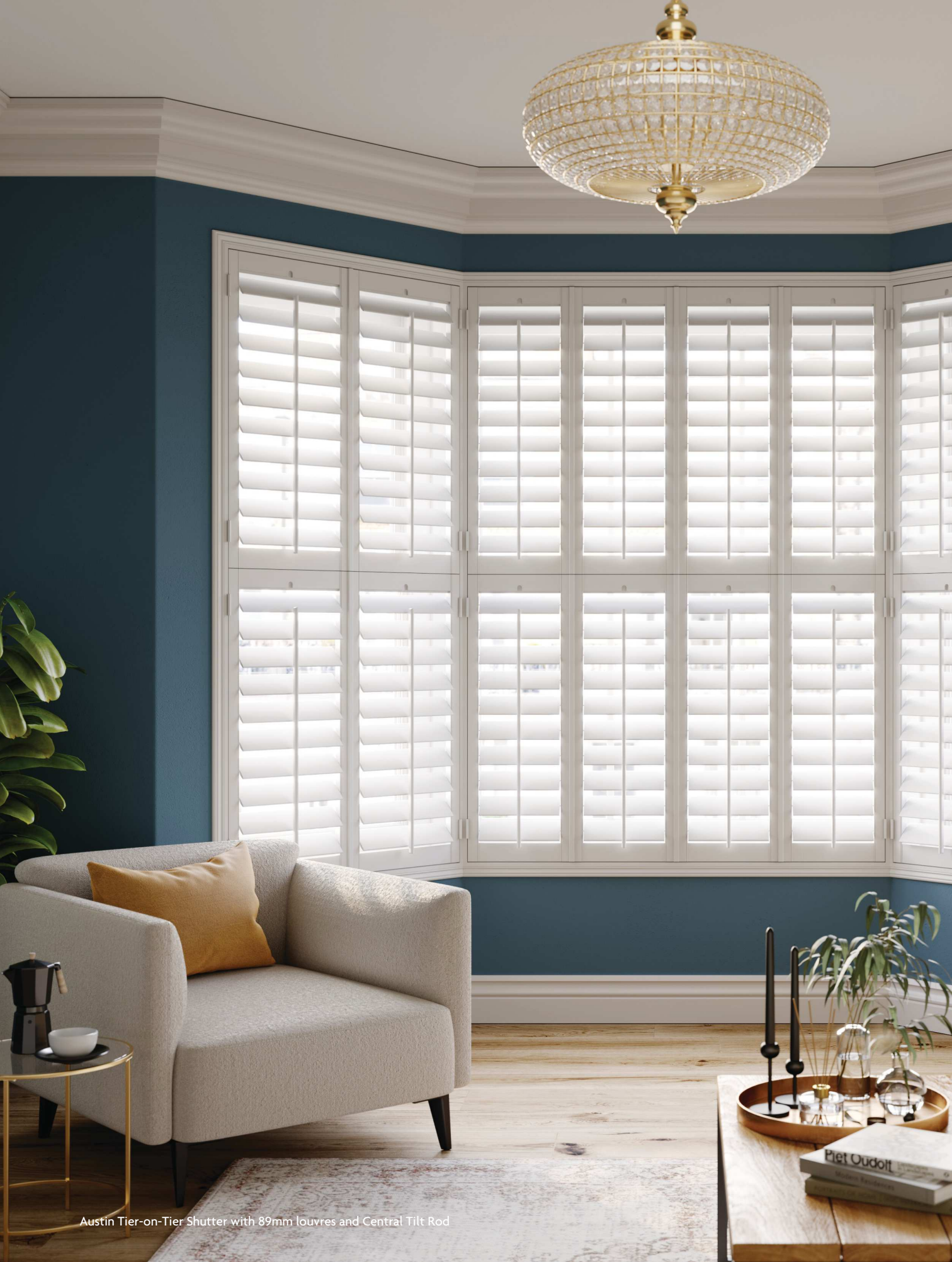
Austin Tier-on-Tier Shutter with 89mm louvres and Central Tilt Rod