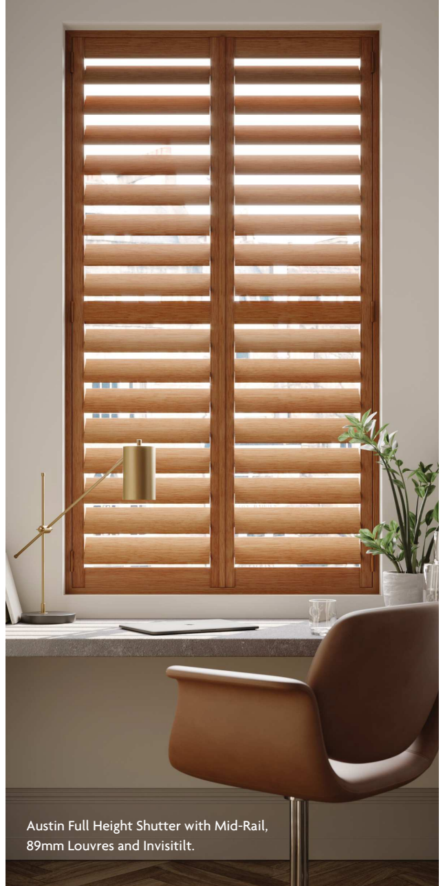
Austin Full Height Shutter with Mid-Rail, 89mm Louvres and Invisiilt.

Sustainable: Paulownia wood is a fast-growing species that is sustainably harvested, making it an eco-friendly choice for those looking to minimize their impact on the environment.