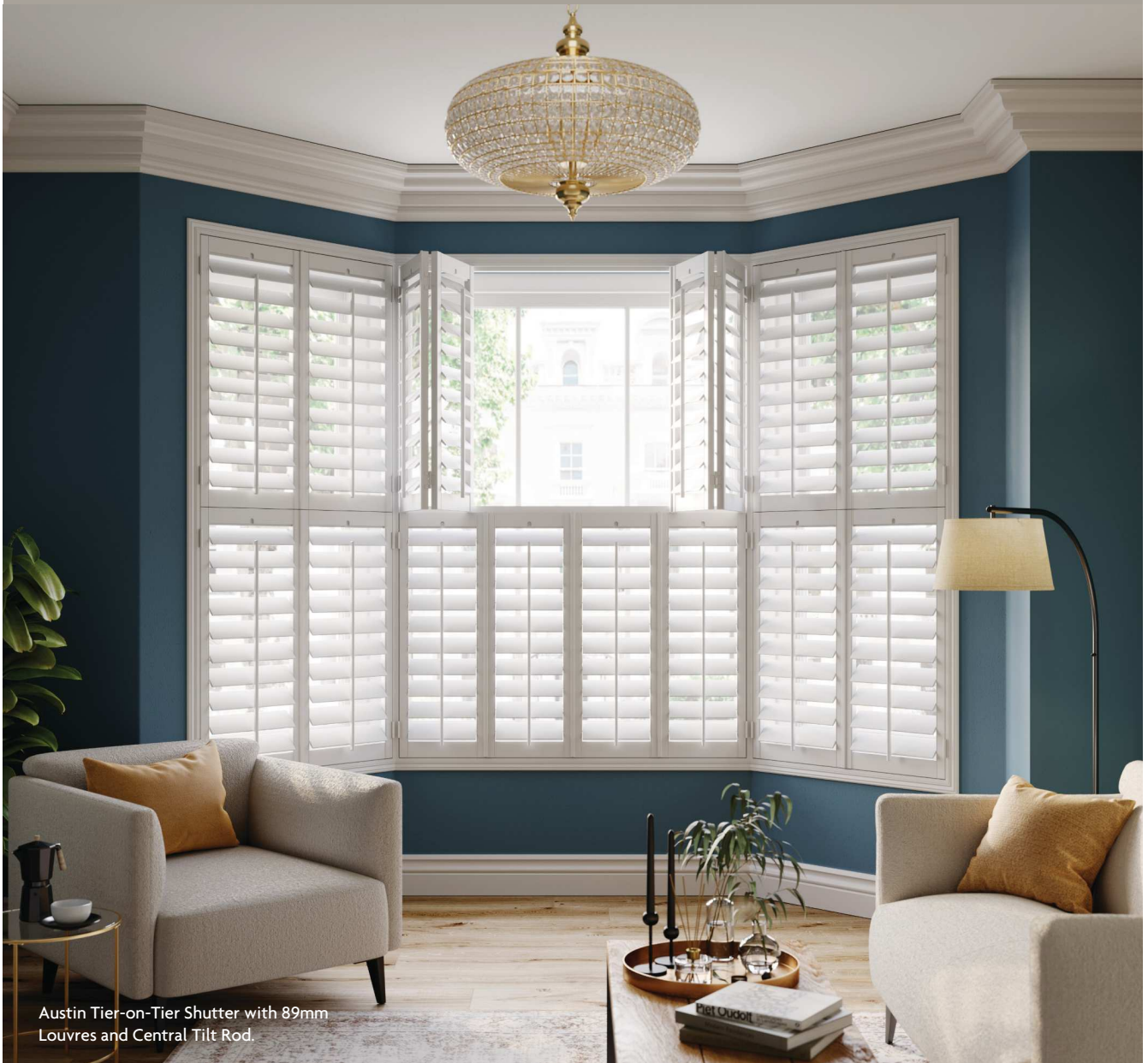
Austin Tier-on-Tier Shutter with 89mm Louvres and Central Tilt Rod.

Tier-on-Tier shutters cover the whole of the window but feature top and bottom panels which open independently of each other. These popular shutters enable versatile control of light and privacy in the daily use of your shutters.