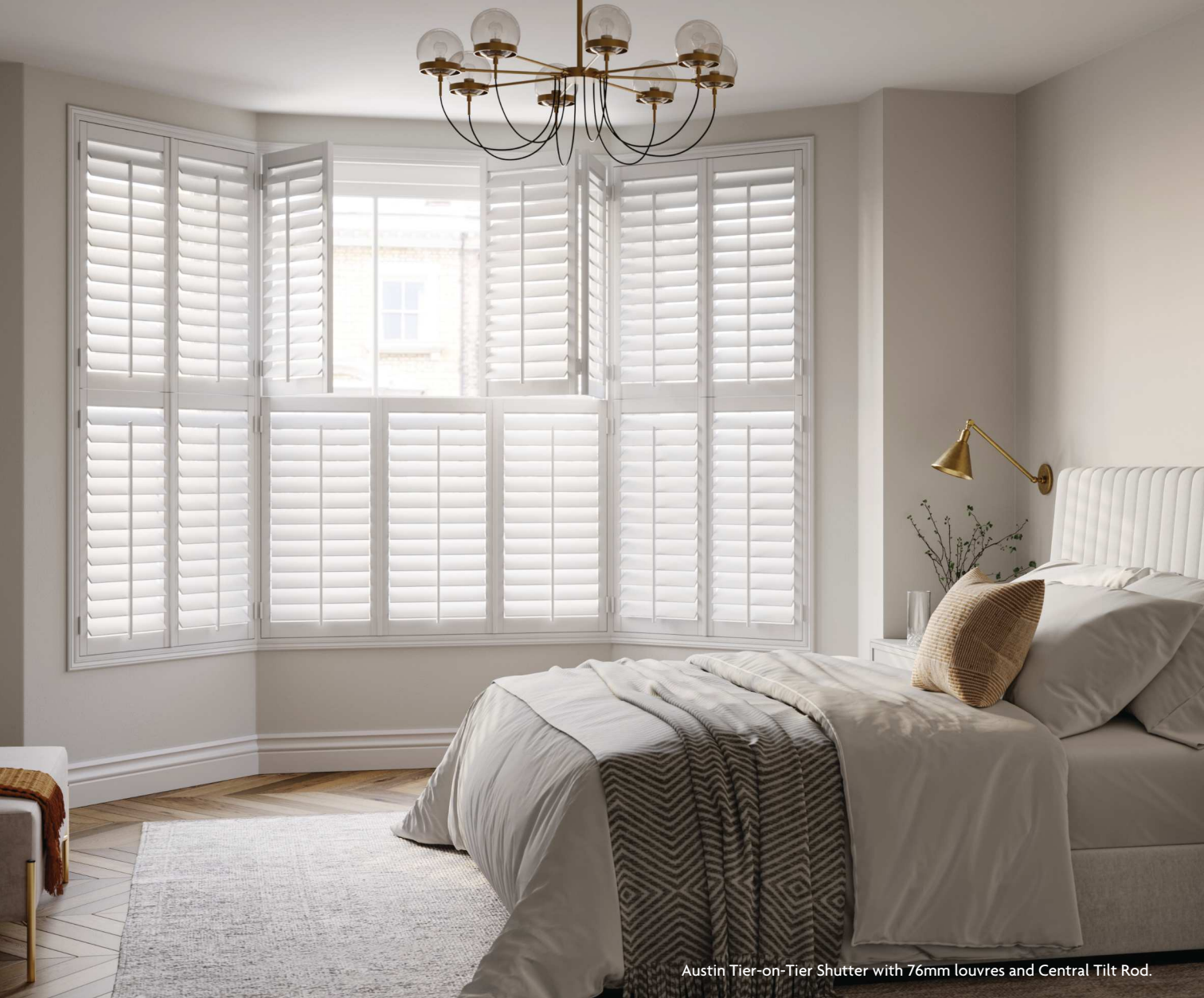
Austin Tier-on-Tier Shutter with 76mm louvres and Central Tilt Rod.