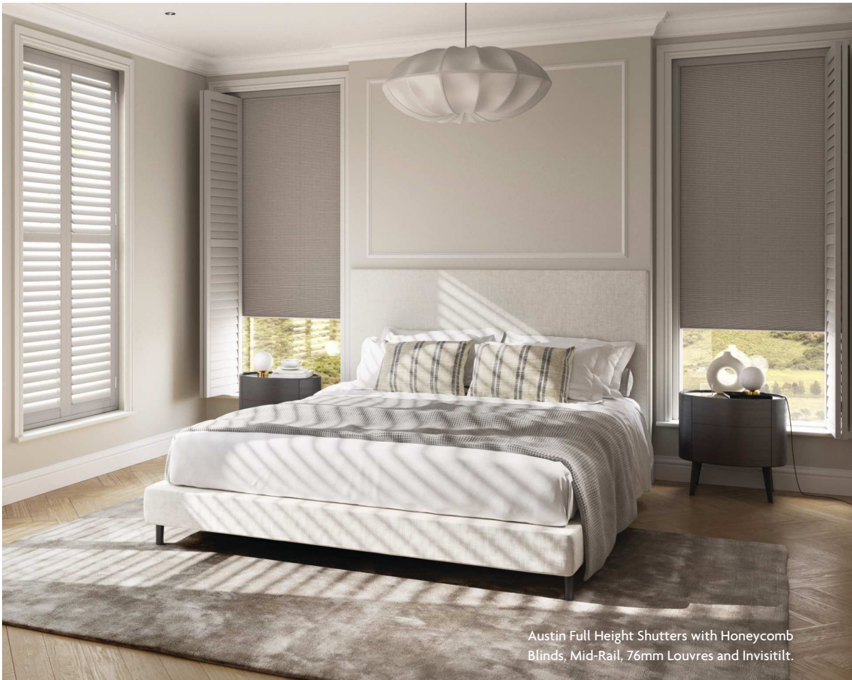
Austin Full Height Shutters with Honeycomb Blinds, Mid-Rail, 76mm Louvres and Invisitilt.