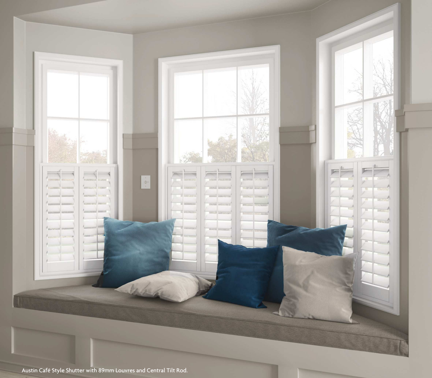
Austin Café Style Shutter with 89mm Louvres and Central Tilt Rod.