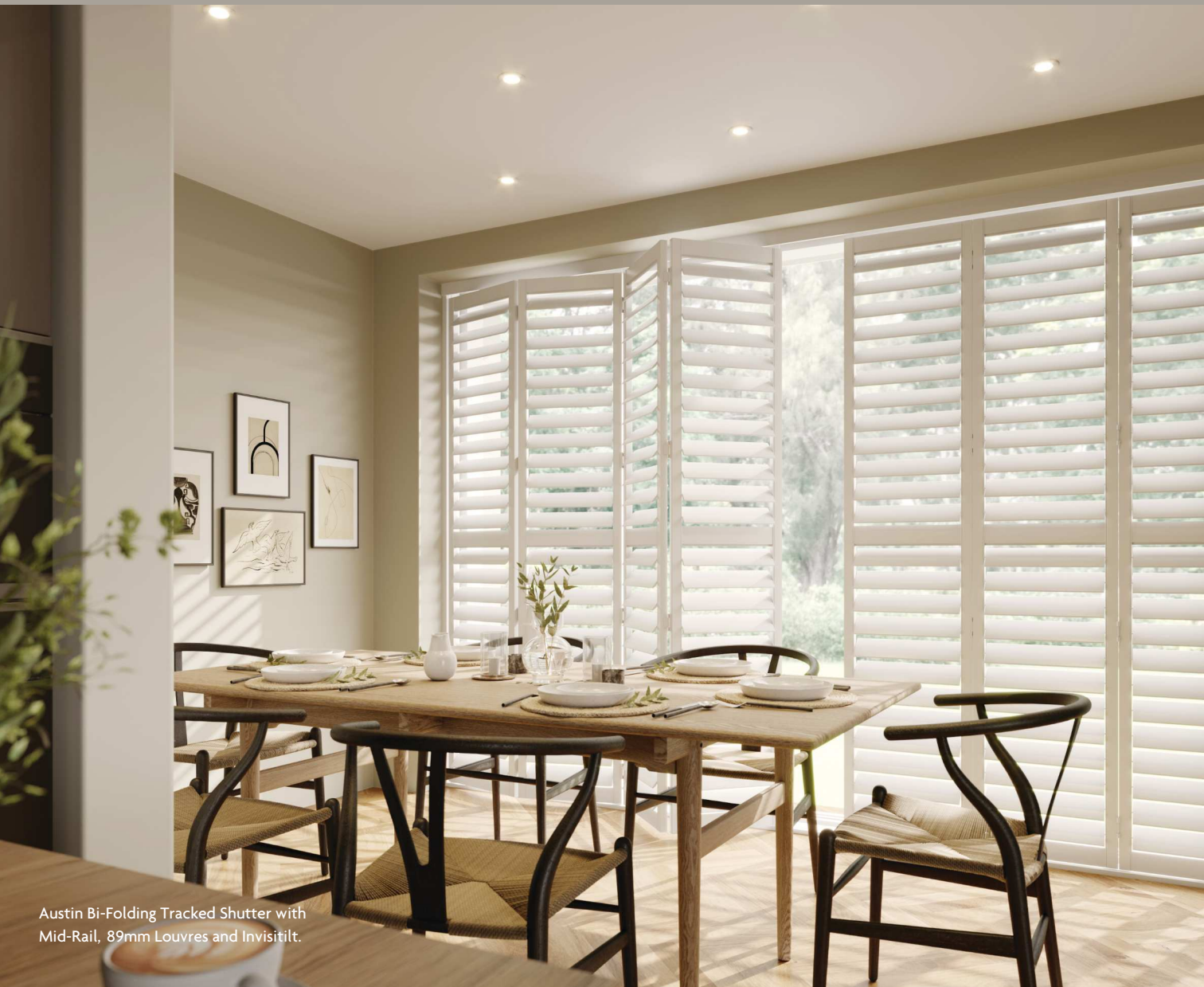
Austin Bi-Folding Tracked Shutter with Mid-Rail, 89mm Louvres and Invisiilt.

Tracked shutters can also be used as a stylish and versatile room divider.