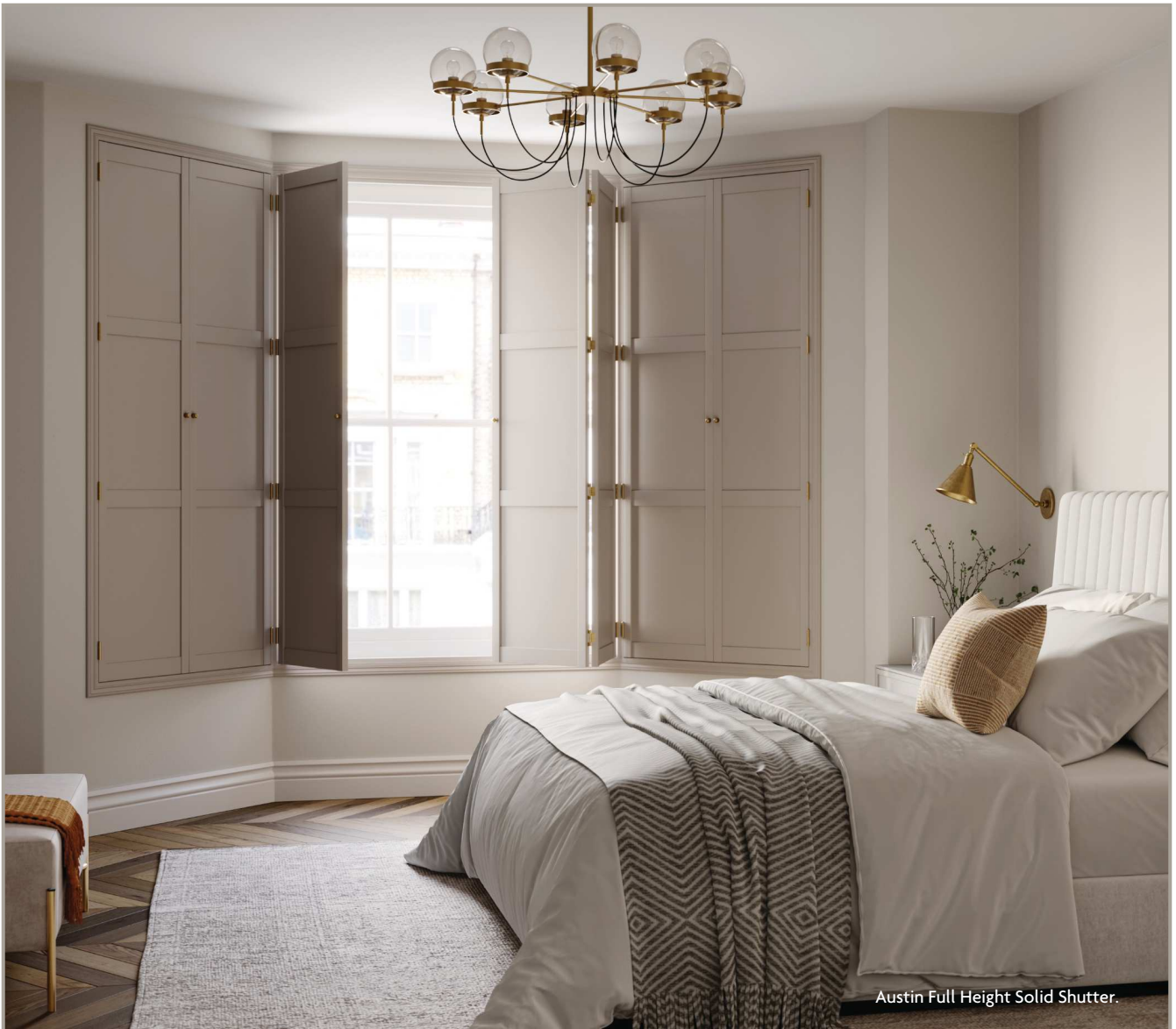
Austin Full Height Solid Shutter.